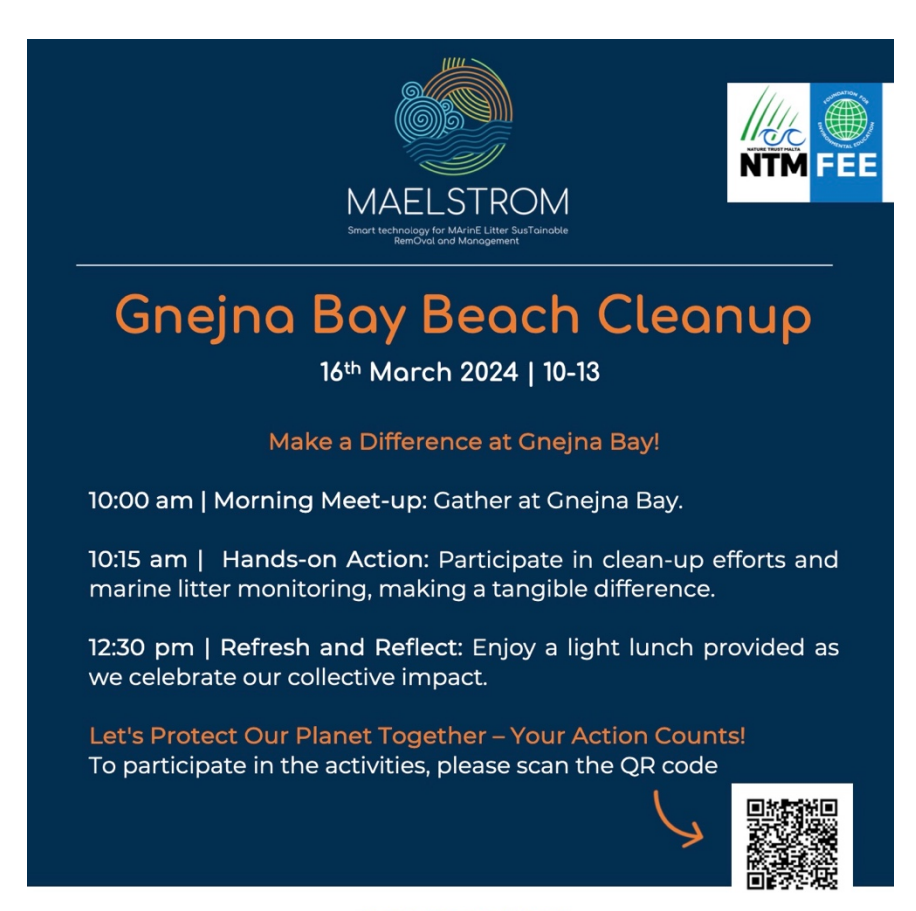
Be There to Care!

Disclaimer: The clean-up is being held with all the necessary permits required from the Environment and Resources Authority (ERA). This initiative has been made possible through the joint efforts and collaboration between the H2020 MAELSTROM project and Nature Trust Malta, thanks to the support of MAELSTROM partners ISDI group LTD, University of Malta, and Venice Lagoon Plastic Free.